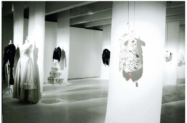
16 Maison Martin Margiela 10 february - 4 march 2007