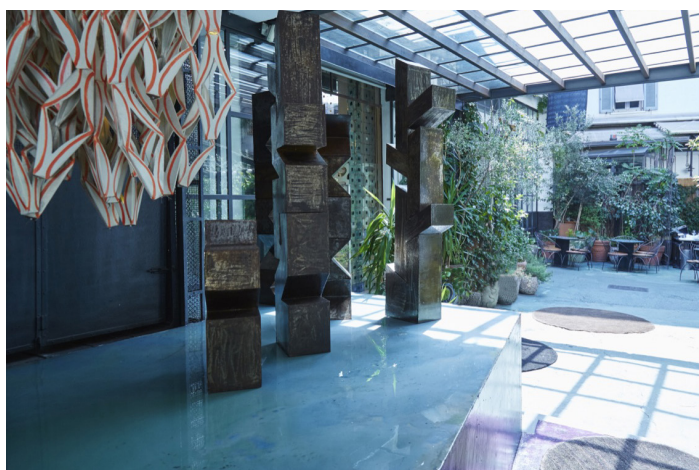
02 Gallery entrance 2016