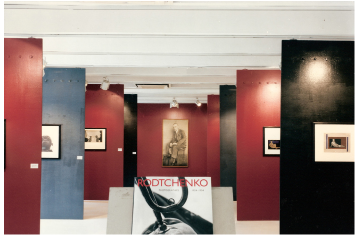
04 Alexander Rodchenko 7 march - 14 april 1996