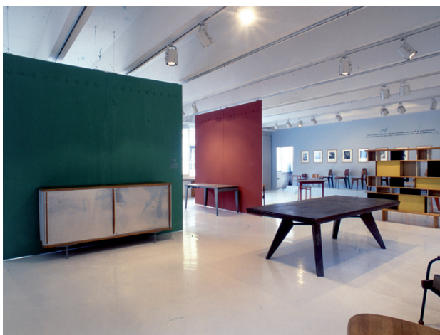
09 Jean Prouvé 12 - 22 april 2000