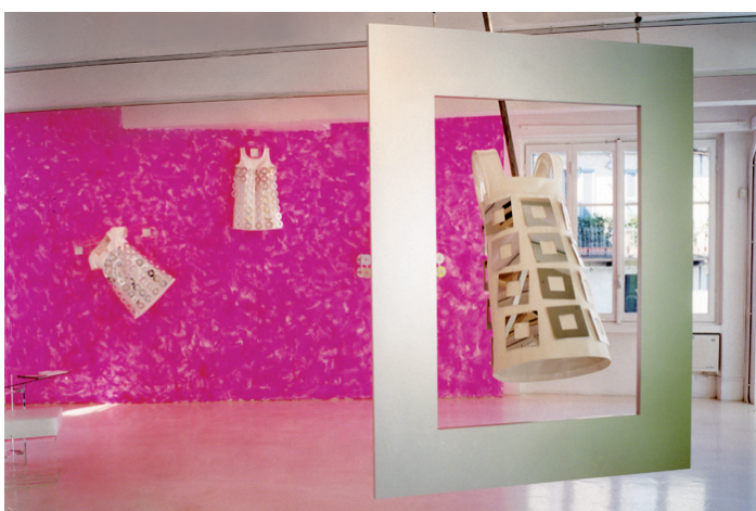
14 Courregès 4 march - 3 april 1999