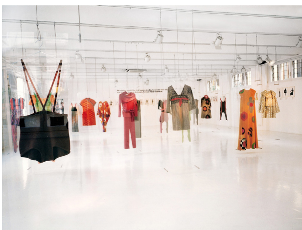
13 Omaggio a Rudi Gernreich 8 october - 15 november 1998