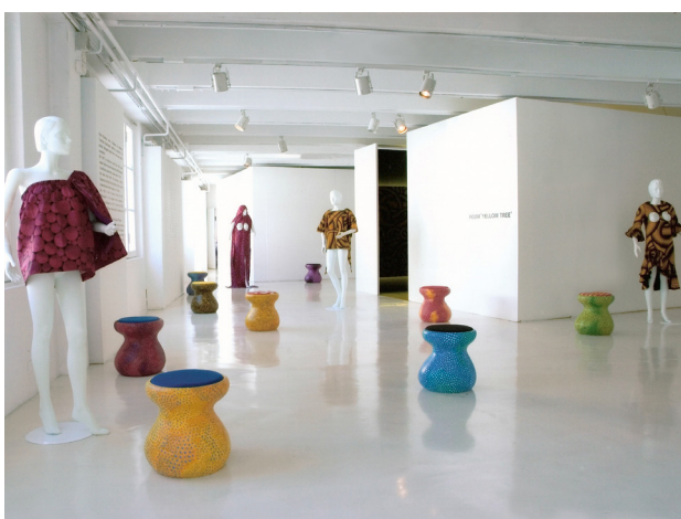
11 Yayoi Kusama 13 april - 1 may 2005