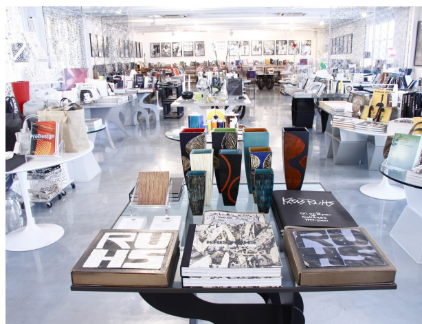
22 Bookshop 2012