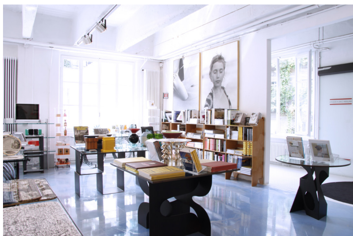
21 Bookshop 2010