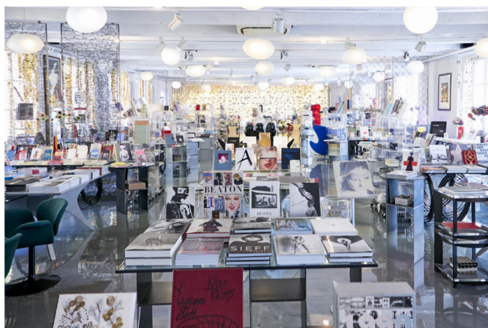
24 Bookshop 2014