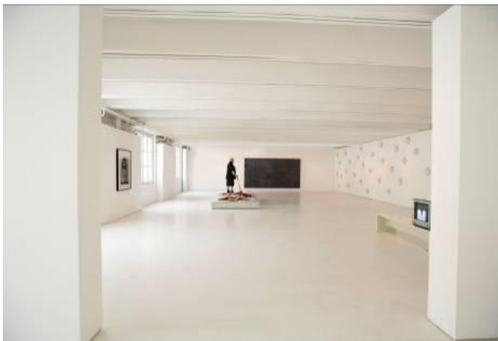
19 Urs Luthi 3 november - 2 december 2007