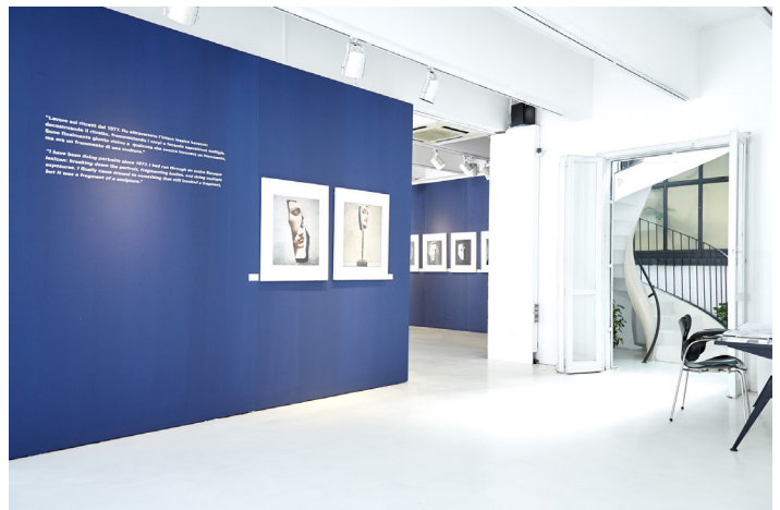
08 David Seidner 3 september - 13 november 2016