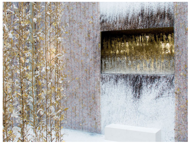
20 Kris Ruhs "Hanging Garden" 11 - 26 april 2015