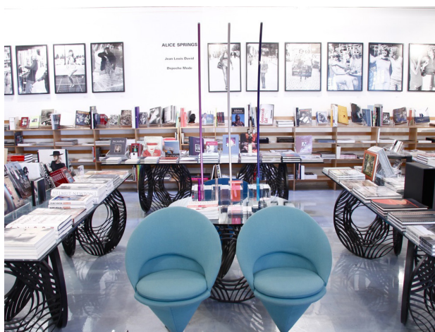
23 Bookshop 2012