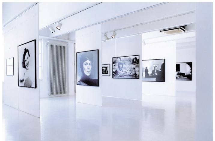
06 Alice Springs, Helmut Newton 29 september - 7 november 1999