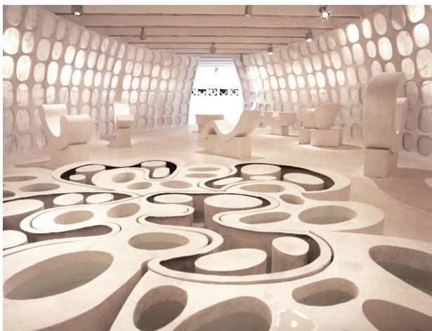
17 Kris Ruhs "Installation" 4 april - 6 may 2001