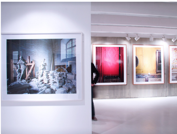
07 Robert Polidori 15 january - 27 march 2011