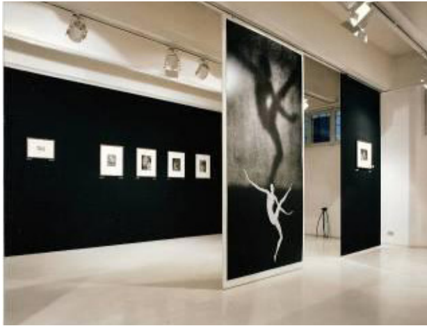
03 Frantisek Drtikol 1 - 31 december 1995