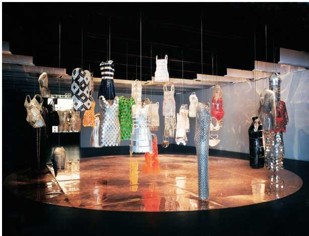
15 Paco Rabanne 25 september - 3 november 2002