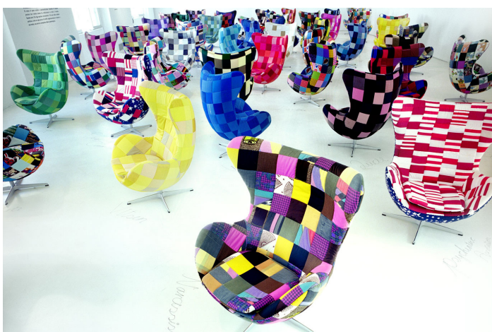
12 Arne Jacobsen 15 - 27 april 2008