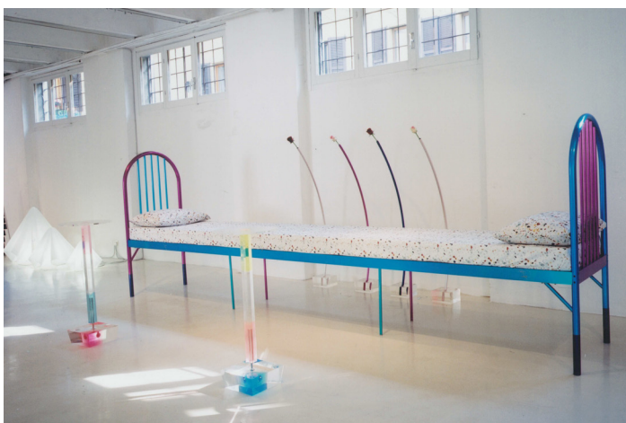
10 Shiro Kuramata 9 april - 11 may 2003