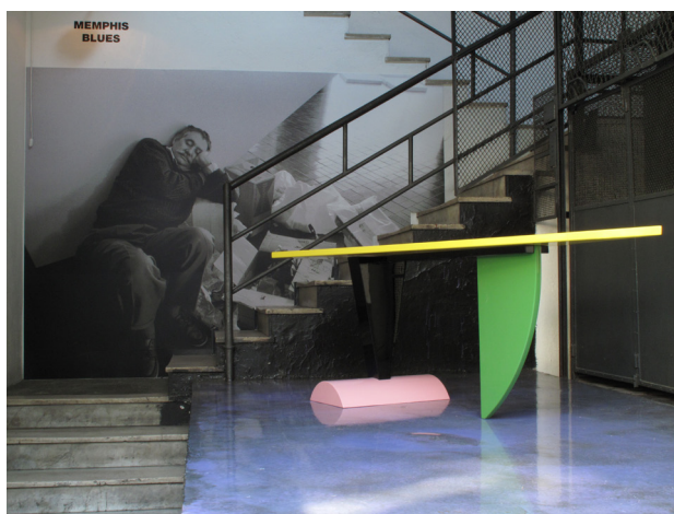
01 Memphis Blues 22 April - 3 May 2009

The foundation has its own publishing company, also dedicated to art, photography, fashion and design, and its bookshop had been recognized internationally as one of the best in the world, praising its unique atmosphere and cultural value, a recognition of its commitment to culture and art.