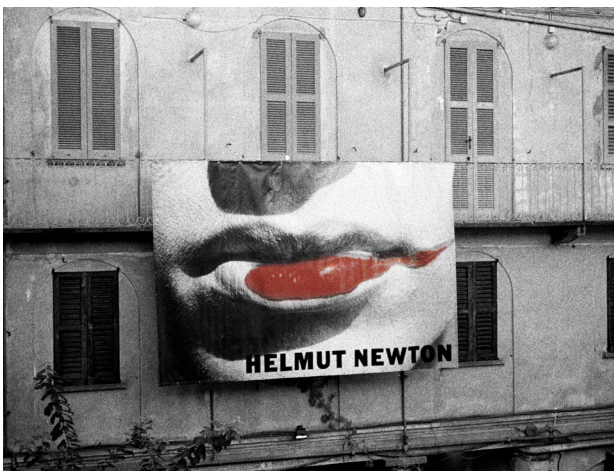
05 Helmut Newton 3 october - 10 november 1996